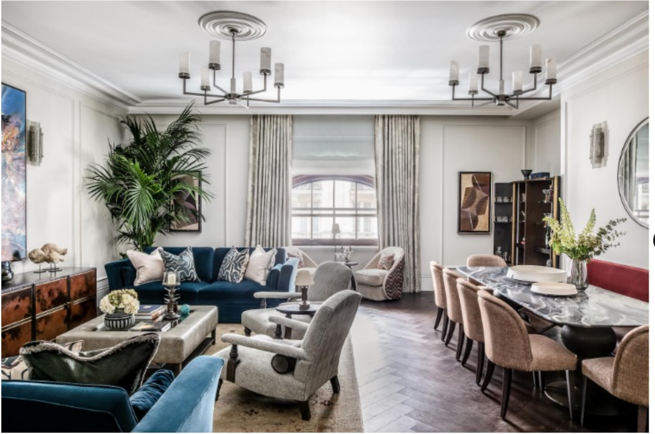
Tags: TheOWO house home interior design art London