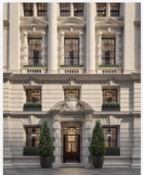
Spies Entrance at The OWO

Angel O'Donnell's scheme (below) is aimed at a “discerning, seasoned traveller and cultural connoisseur”, with key pieces including a vellum drinks cabinet, marble dining table and velvet sofas.