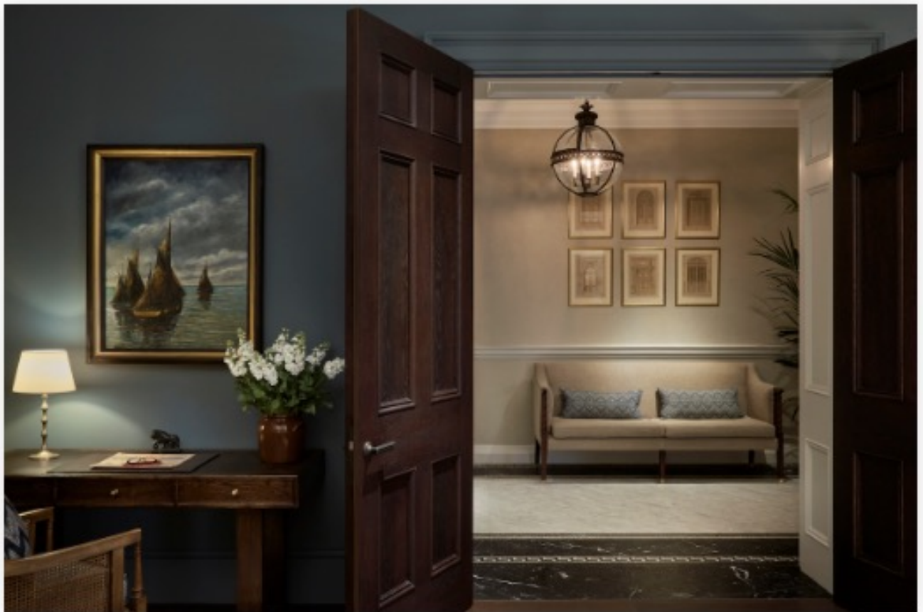
Inside the Albion Nord show residence

The 760,000 square foot project – which topped out in 2020 and is due to complete later this year – is also delivering a 120-key Raffles hotel and 11 bars and restaurants.