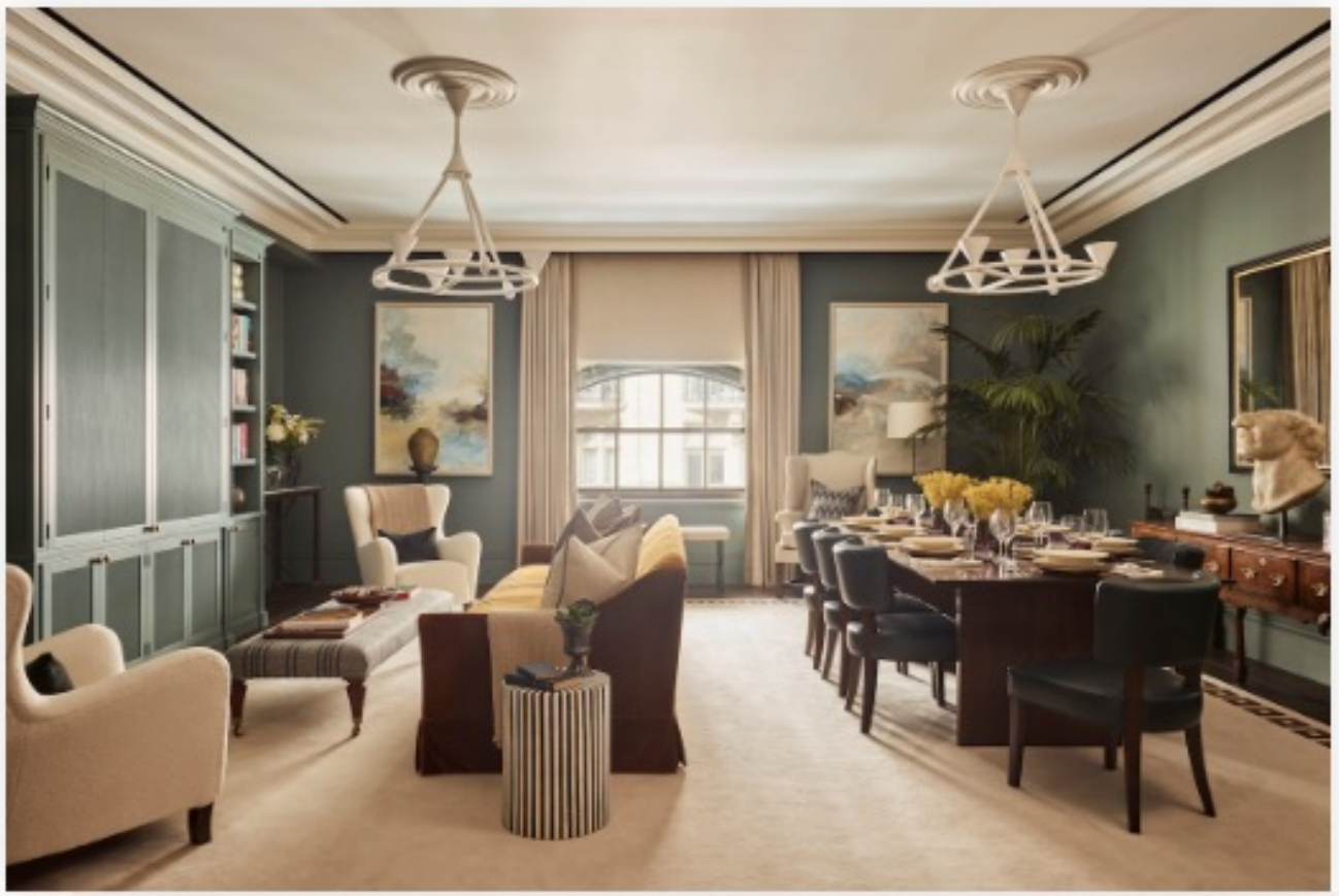
Reception room at the Albion Nord show residence (1,999 sq ft/£10mn)