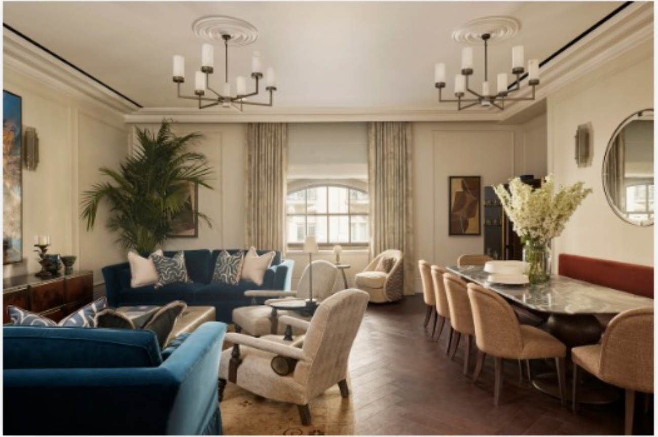
Inside the Angel O'Donnell show residence (2,807 sq ft/£14.25mn)