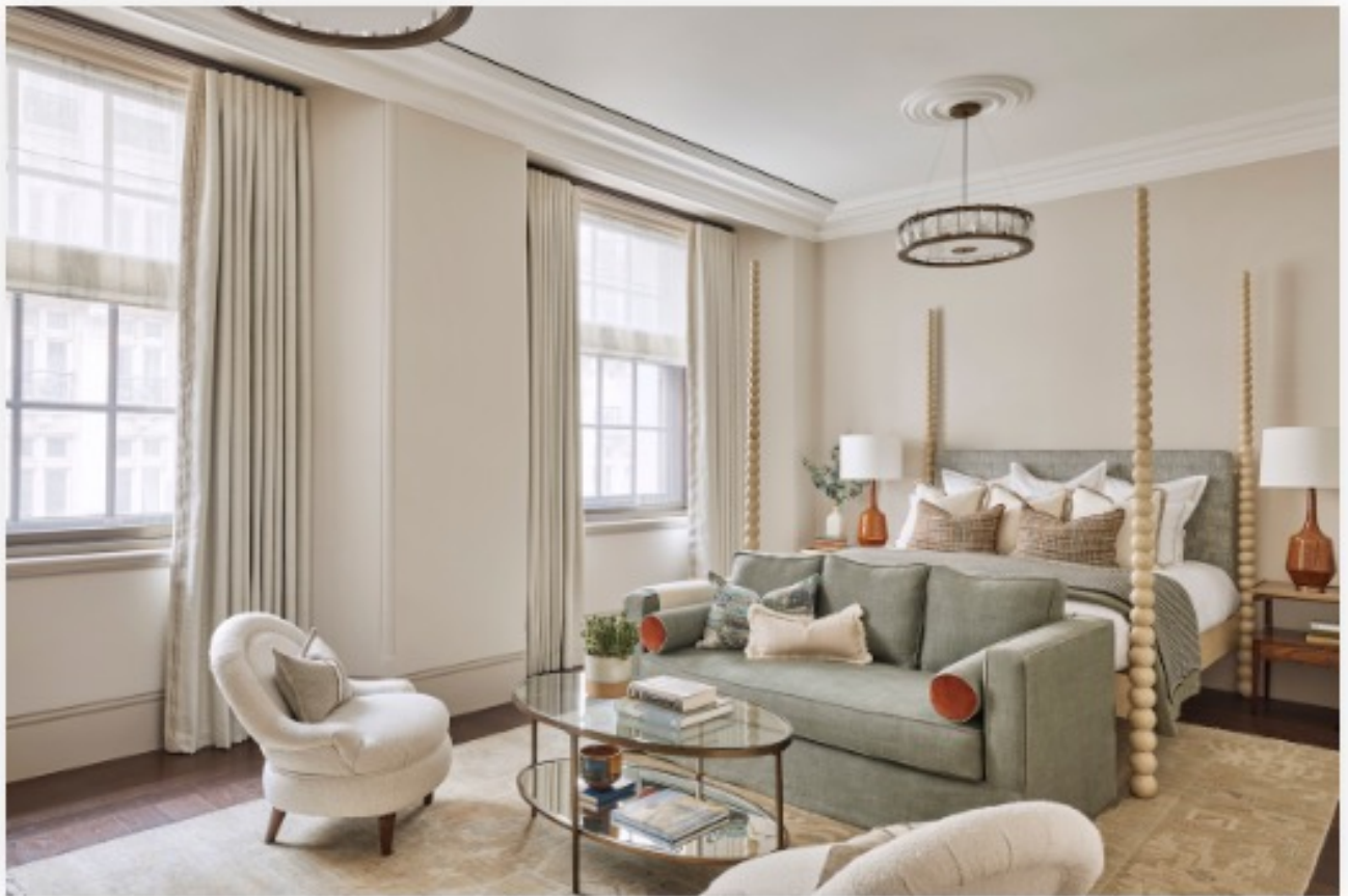
Bedroom at the Angel O'Donnell show residence

Albion Nord's contrasting creation (below) is inspired by the British Eclectic style. The site's heritage and British craftsmanship were also key themes for the team, who have mixed antique furniture, sculpture and plants with contemporary pieces to great effect.