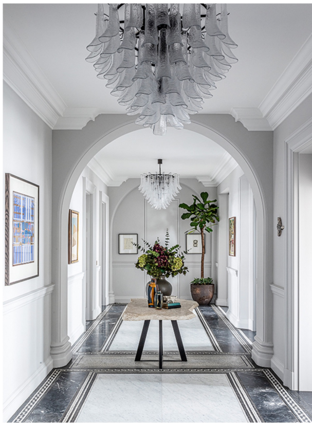
The grand hallway leads to the kitchen and three bedrooms and is adorned with mid-century Murano-glass pendants.