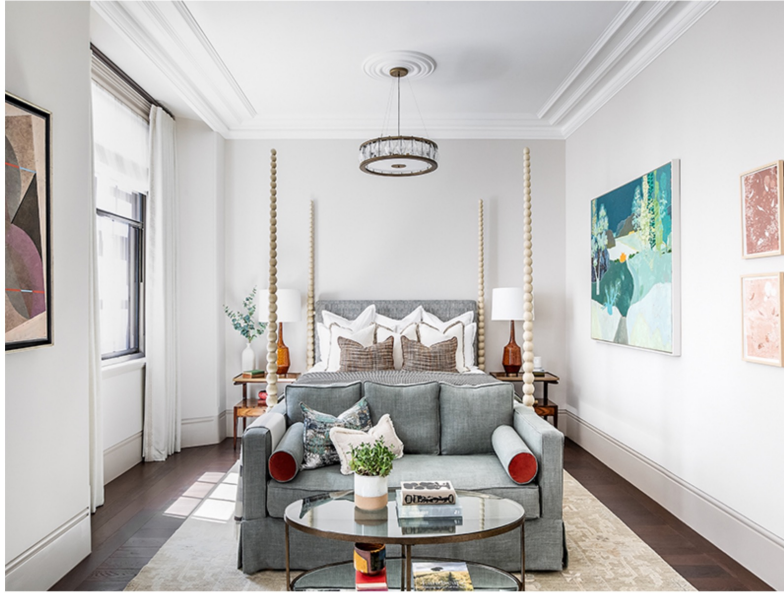
The principal bedroom includes a dreamy four-poster bobbin bed by Julian Chichester, a pioneer of contemporizing classic English furniture.

The principal bedroom includes a dreamy four-poster bobbin bed by Julian Chichester, a pioneer of contemporizing classic English furniture. A soft sage-linen sofa along with soft wool boucle armchairs add to the room's warmth and comfort. The plaster wall lights that are theatrically shaped like woodland flutes from Porta Romana, a British lighting manufacturer, emit the toastiest of glows. The splendid space is also replete with art by veteran landscape artist Richard Ballinger and neo-pop-art legend Damien Hirst .