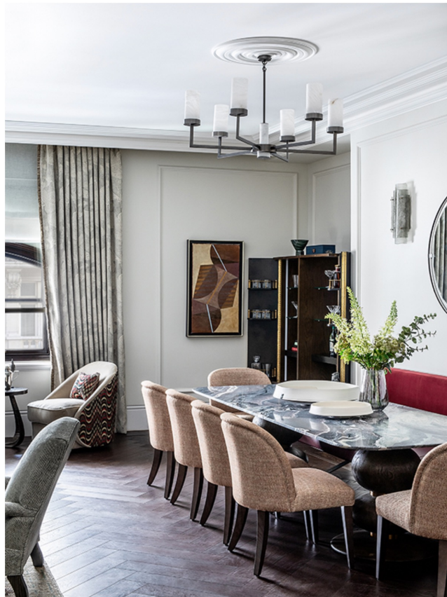
The dining area features a banquet-sized table, honed from a single slab of Italian Rosso Luana marble.

The living room exudes pin-sharp detailing, weaving in multicultural flavours including bespoke velvet sofas, a hand-knotted Persian rug with Arabesque ornamentation and an eclectic mix of decorative pieces. A Renaissance-inspired oil painting by a Colombian-born artist creates an arresting focal point in the living room. The dining area features a banquet-sized table, honed from a single slab of Italian Rosso Luana marble complemented with a carmine-coloured bench and sand and chestnut-toned chairs.