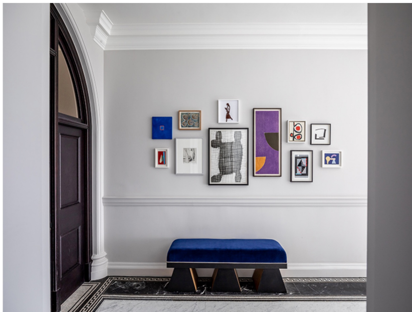
The heavy arched door instantly fosters a cultural identity while the hallway includes a brutalist-inspired bench against a wall of abstract collages.