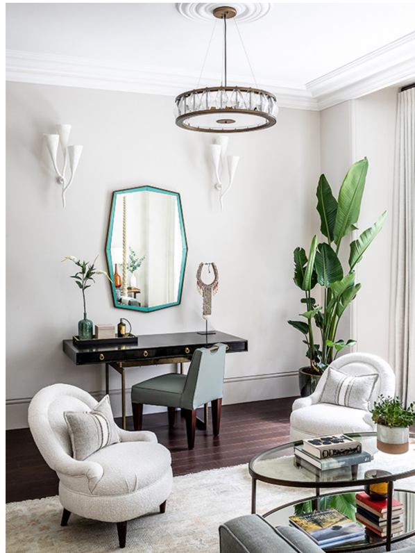
A soft sage-linen sofa along with soft wool boucle armchairs add to the room's warmth and comfort.

The principal bedroom includes a dreamy four-poster bobbin bed by Julian Chichester, a pioneer of contemporizing classic English furniture. A soft sage-linen sofa along with soft wool boucle armchairs add to the room's warmth and comfort. The plaster wall lights that are theatrically shaped like woodland flutes from Porta Romana, a British lighting manufacturer, emit the toastiest of glows. The splendid space is also replete with art by veteran landscape artist Richard Ballinger and neo-pop-art legend Damien Hirst .