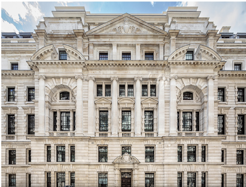
Any building with such a notable past provides a perfect canvas to celebrate the time-honoured craft techniques.