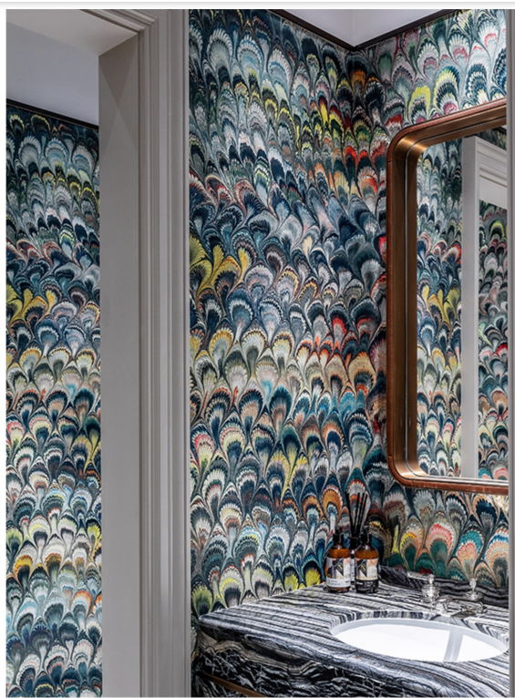
The cloakroom is covered in impactful marbled wallpaper of kaleidoscopically bright colours and mesmeric swirls.

The elements of this space work in unison to create a home that hits the sweet spot of beauty, tactility and that all-important comfort. Angel O'Donnell, in its aim to deliver the most unique and deluxe residences, has created interiors that celebrate The OWO's cultural pedigree. "We had to maintain a discriminatory eye and wheedle out anything that evoked the building's past too thirstily. This was an exercise in vigilance, constantly cross-referencing patterns, colourways, fabric choices, mixed-media art, lighting and furniture designs. Ironically, the more we edited, the more effortless our choices appeared, which is what you want at the end of the day" , concludes Ed O'Donnell.