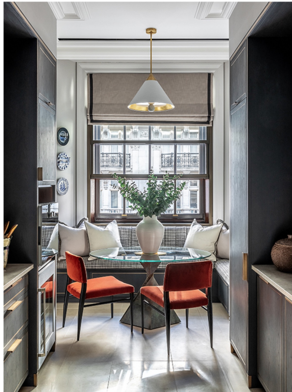
A handcrafted sculptural table with a twisted oxidised copper base occupies the ergonomic kitchen space.

The grand hallway leads to the kitchen and three bedrooms, and is adorned with mid-century Murano-glass pendants and a raw-edged stone table. A handcrafted sculptural table with a twisted oxidised copper base, by celebrated British designer Tom Faulkner, occupies the ergonomic kitchen space. It is further accentuated by vintage chairs, upholstered in rust velvet and a densely-textured banquette with multi-yarn cushions.