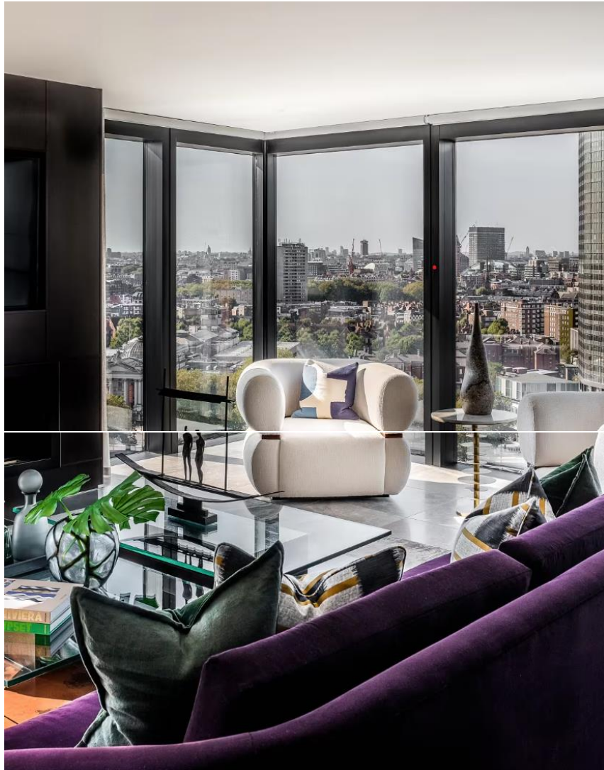
A reading chair is set in the window in a room designed by London-based interior design firm Angel O'Donnell.